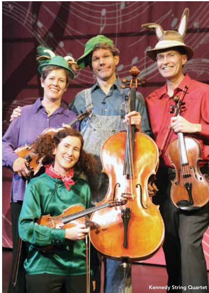
Kennedy String Quartet