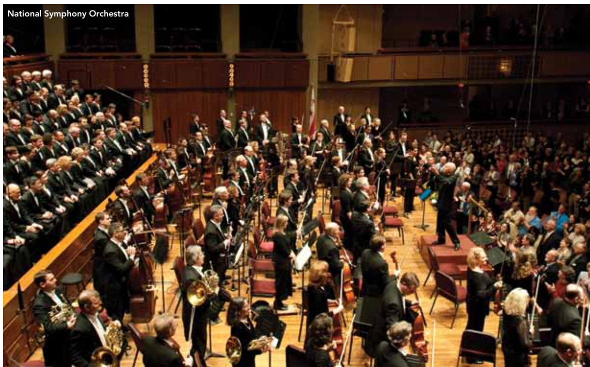
National Symphony Orchestra

This unique series pairs renowned artists with some of the world's most beloved classical works for seven memorable concerts, each taking place on either Friday or Sunday afternoon.