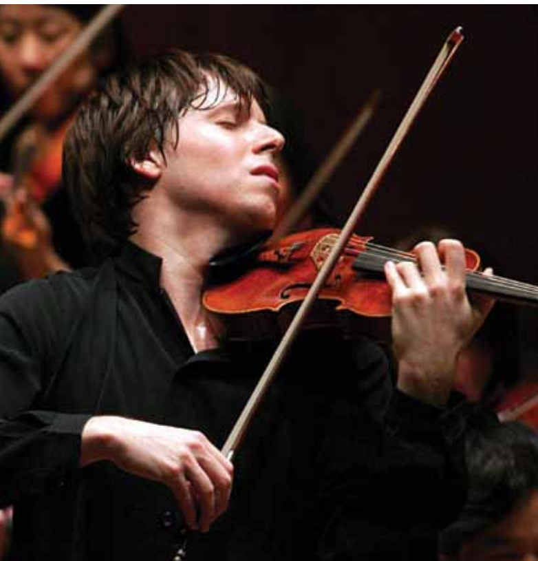
Joshua Bell ; Opening Ball

The National Symphony Orchestra and Music Director Christoph Eschenbach open the 2011–2012 season with the spectacular Season Opening Ball. Each year, this event attracts executives from many Fortune 500 companies, government officials, prominent politicians, members of the diplomatic corps, and philanthropic leaders from across the nation. This season, Maestro Eschenbach will be joined by superstar violinist Joshua Bell.