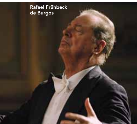
Rafael Frühbeck de Burgos

May 31, June 1, and 2 Christoph Eschenbach, conductor BEETHOVEN: Symphony No. 7