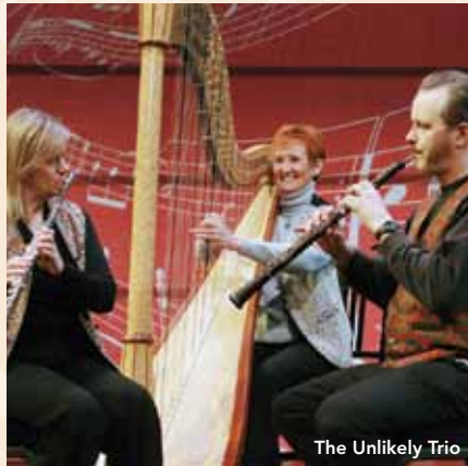
The Unlikely Trio

Designed to acquaint young children with classical music and the instruments of the orchestra, NSO Kinderkonzerts feature small groups of NSO musicians who demonstrate their instruments and perform short pieces of music, both classical and popular. These performances involve the children as participants as well as listeners. Previous Kinderkonzerts have included Strings and Stories , featuring the Kennedy String Quartet, and Got Rhythm? , an exploration of where rhythm comes from.